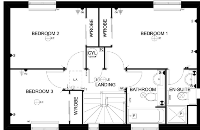
FIRST FLOOR PLAN DER 4.